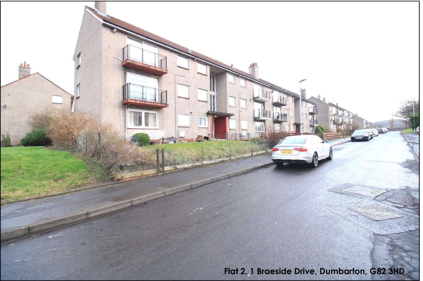
Flat 2, 1 Braeside Drive, Dumbaron, G82 3HD

This two bedroom first floor apartment is located in the popular Bellsmyre area to the north of Dumbaron town centre where local amenities such as shops, primary schools, children's nurseries are within 10 minutes walking distance.